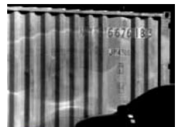
The extended spectral range of FLIR's NIR and SWIR cameras allows seeing through materials such as paint or blood. Water or ice presence into materials is also enhanced.