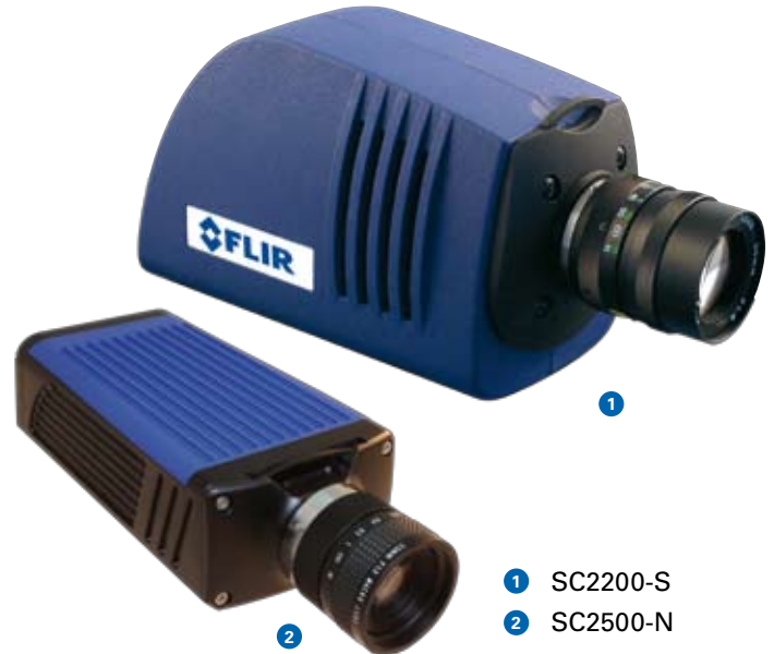
1 SC2200-S 2 SC2500-N